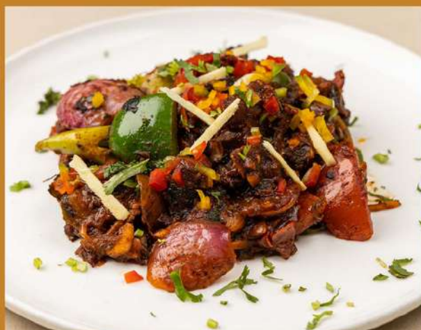
Mutton Salli Gosht Curry