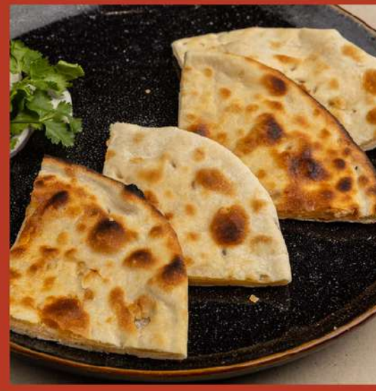
Lasooni Naan (Garlic) 320