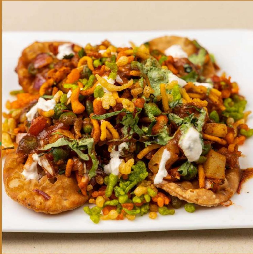
Hamari Papdi Chaat