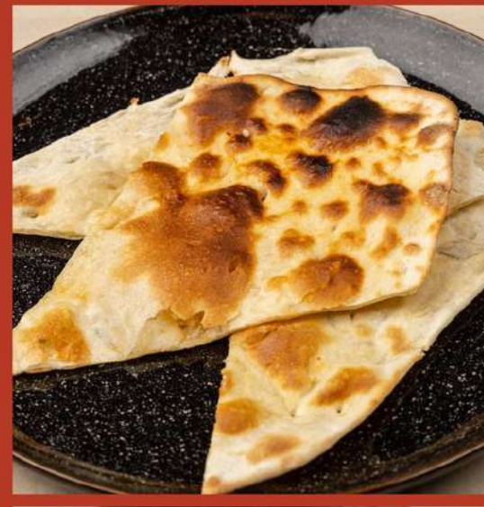
Plain Naan 250