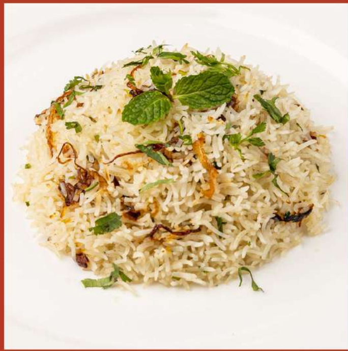
Ghee Rice 600