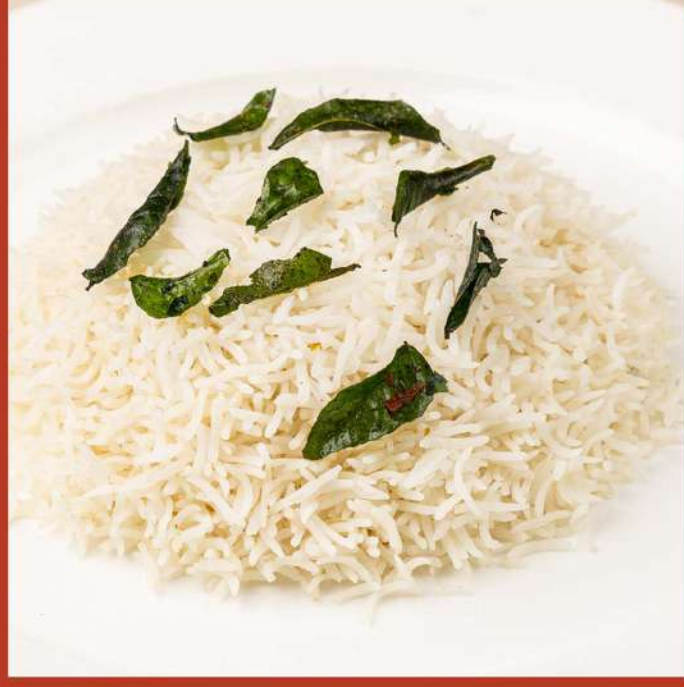
Steamed Rice 450