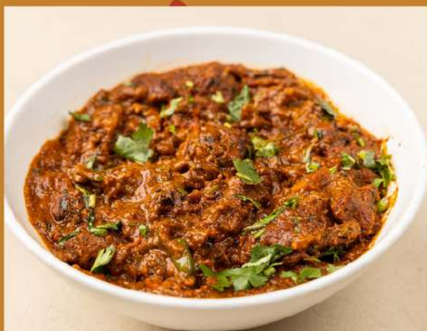
Ghee Roast Chicken Curry