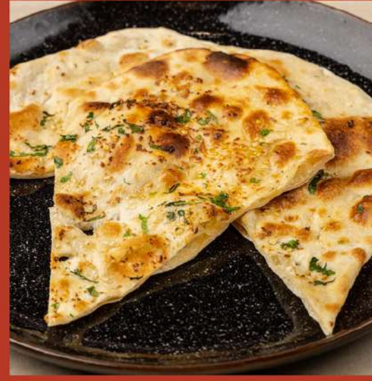
Butter Naan 300