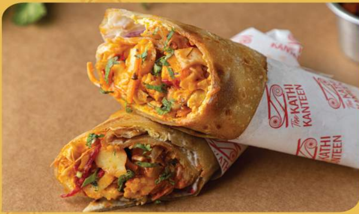
PANEER BUTTER MASALA ROLL