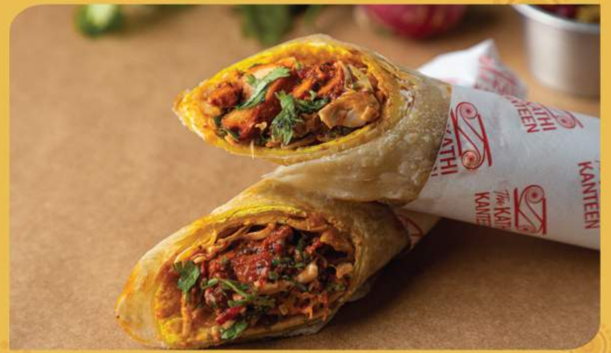
CHICKEN TIKKA ROLL