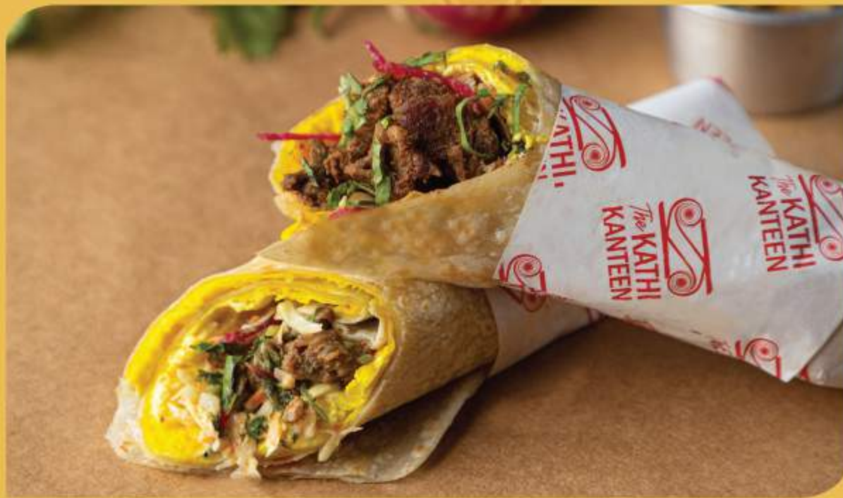
BHUNA MUTTON ROLL