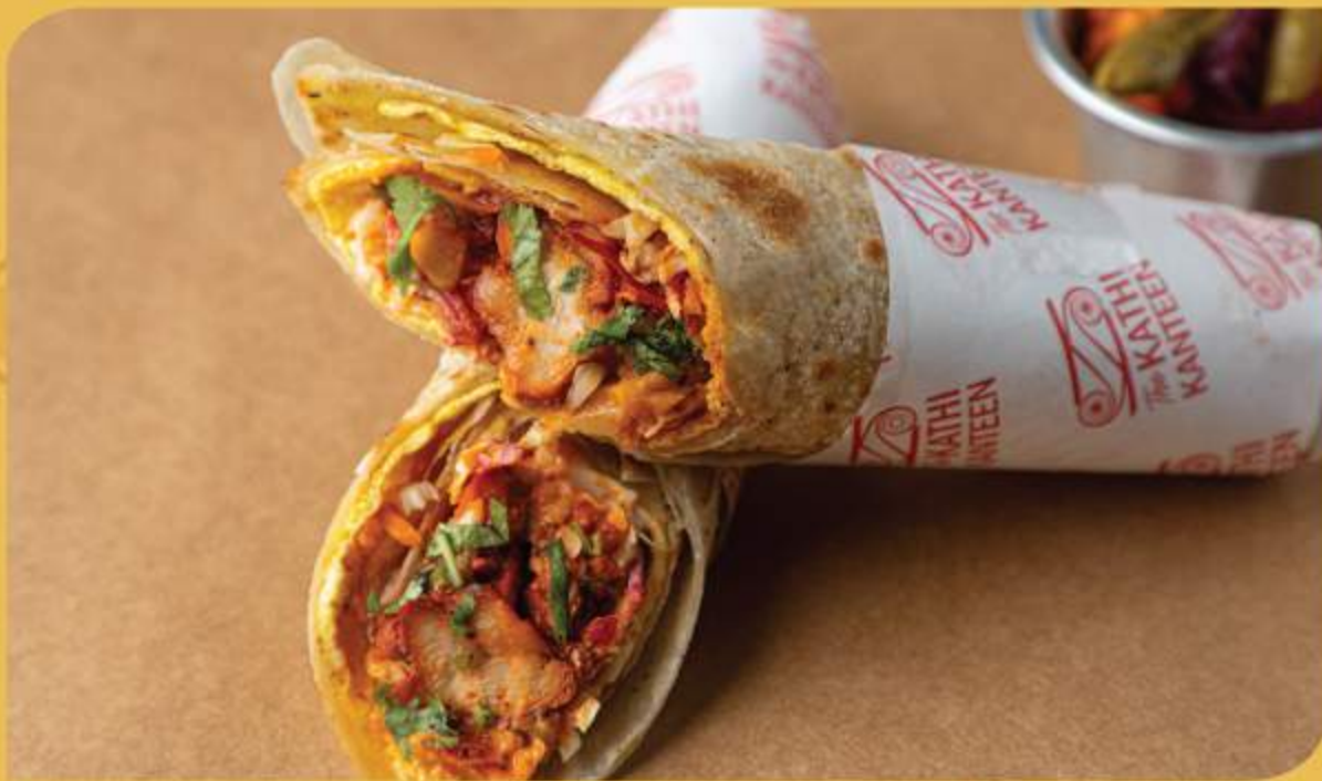
BUTTER CHICKEN ROLL