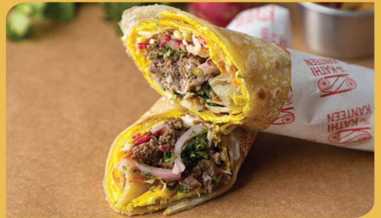
BEEF SEEKH KEBAB ROLL