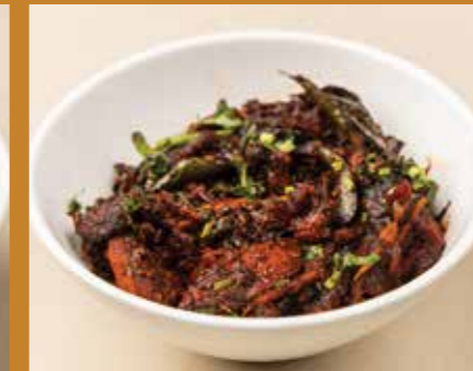
Ghee Roast Chicken Curry