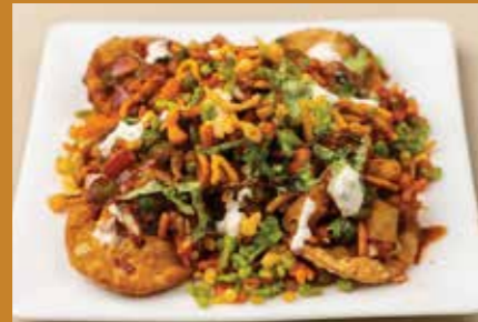
Hamari Papdi Chaat