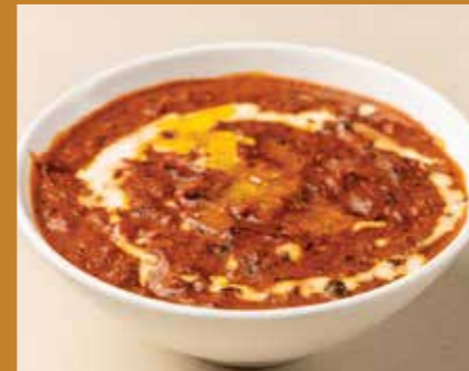
Murgh Makhani (Butter Chicken)