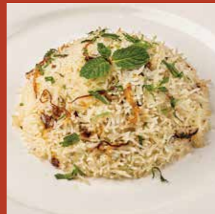
Ghee Rice 350