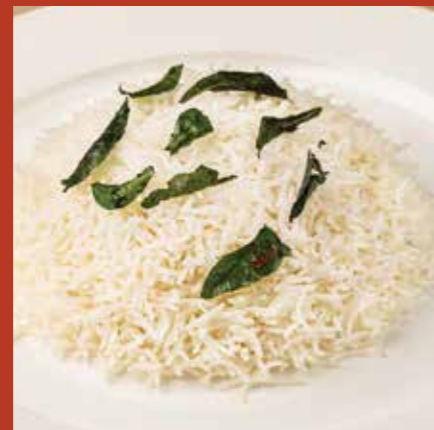
Steamed Rice 250